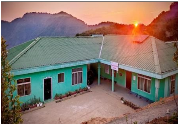
Public Health Centre at Thingsai High School at Thingsai